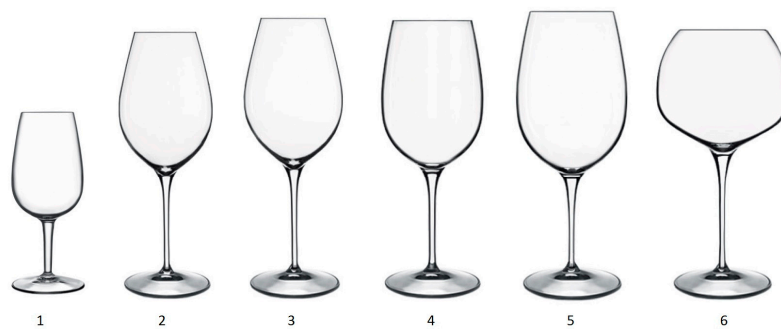
Figure 1. Glasses tested for the experimental trials (see Table 1 for details).

* Maximum diameter divided by opening diameter.