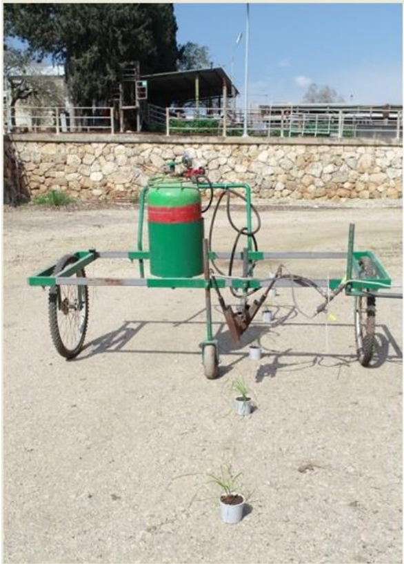
Figure S2: Illustration of two of the effective flaming width experimental treatments, 45° and 30 cm (A) and 30° and 30 cm (B) burner mounting angle and inter-burner distance, respectively. In both images the left hand containers was not treated and used as control.