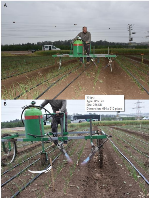
Figure S4: Orlando plants in the Kfar baruch field trial following the flaming treatments; two weeks after two leaf stage application (A) and one week after three leaf application (B).