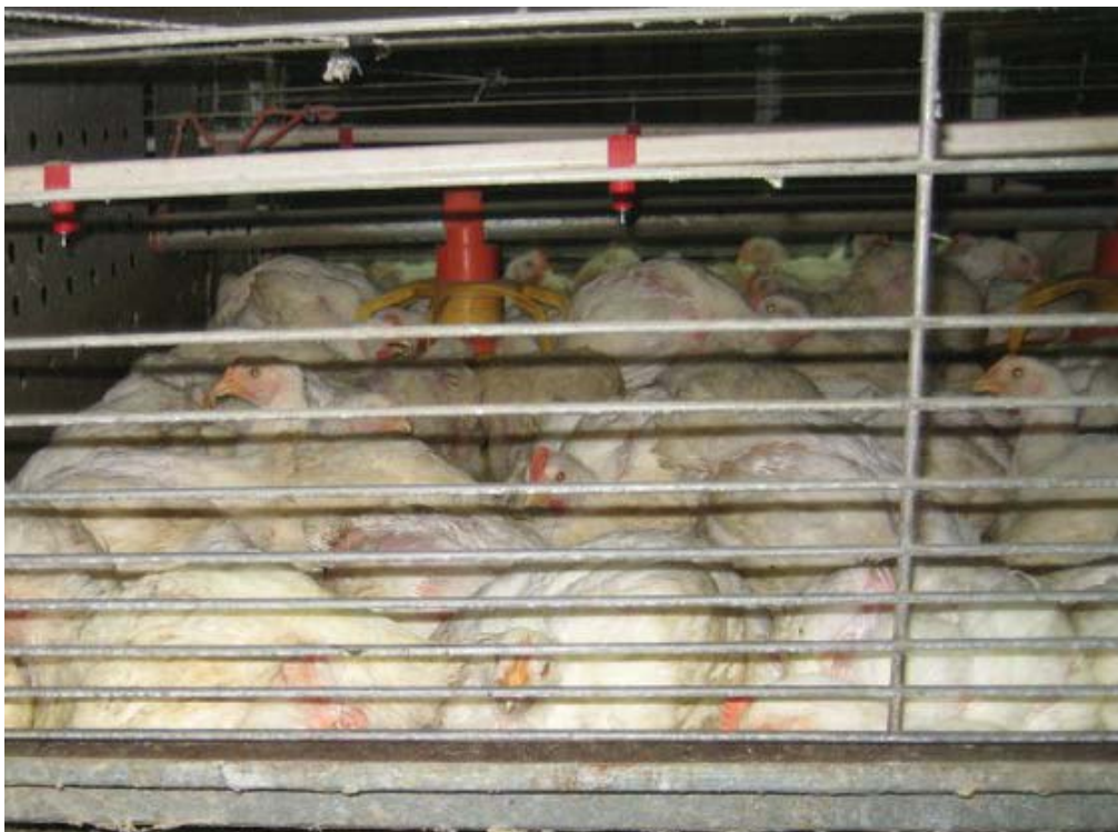
Figure 1. Caged broiler chickens.

Despite the obstacles, interest in developing a cage system that works well for broiler chickens has been ongoing since the 1960s [10]. A variety of cage floor materials have been tested including plastic tubing; plastic and metal mats [5,11]; rubber-covered nylon [12]; bamboo [8]; wire, steel and plastic mesh; perforated Styrofoam; padded doweling [13]; polyester urethane foam [14]; and wooden slats [15]. In the early 1970s a composite mesh floor material was patented, which helped solve earlier