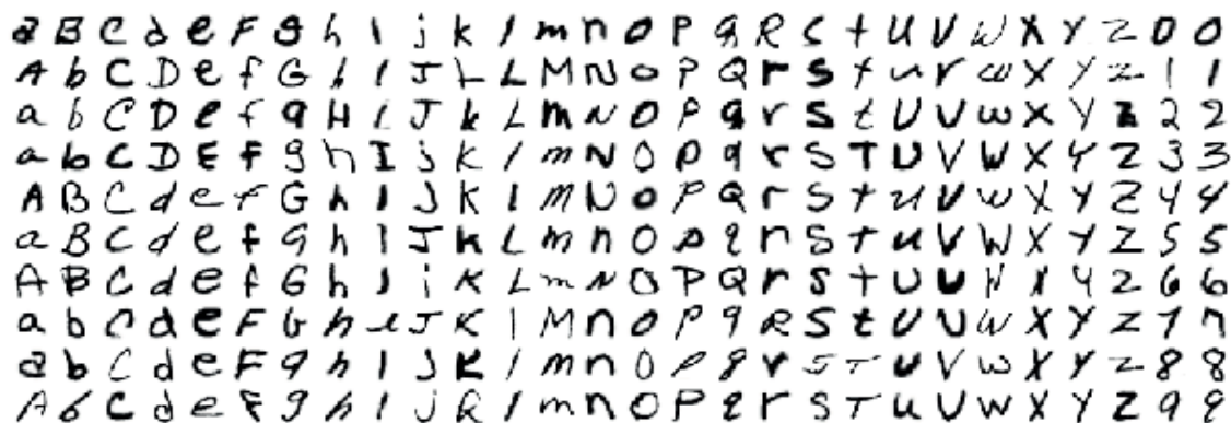
Figure 2. Samples of all letters and digits in the EMNIST dataset.

A sample of the letters and digits in the EMNIST dataset can be found in Figure 2.