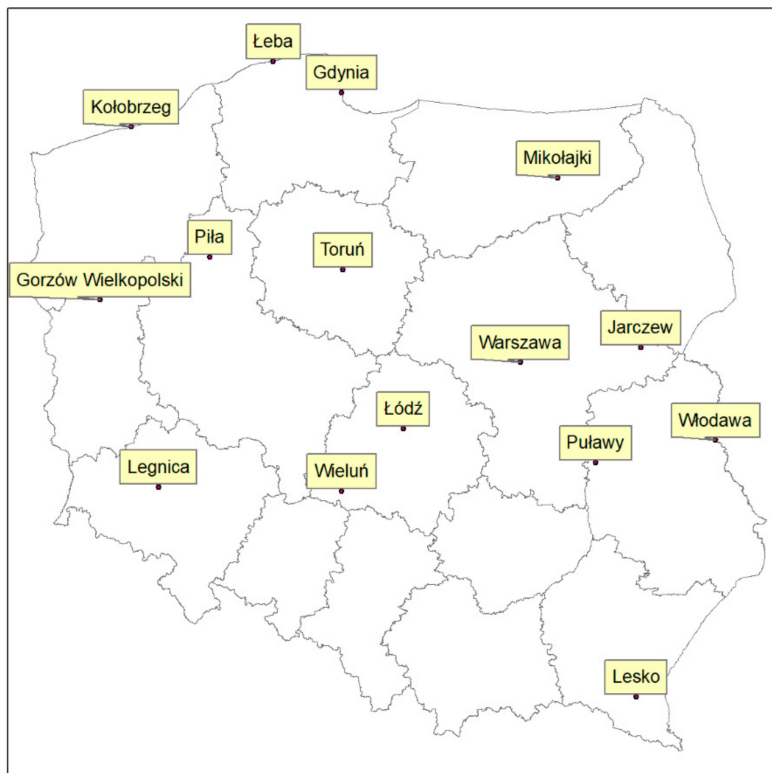
Figure 1. Locations of the stations.

storing, and making meteorological data available [31]. The data for Warszawa and Kołobrzeg stations were obtained from a database of the World Radiation Data Centre [32].