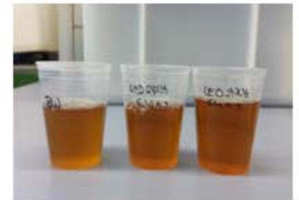
Beverage with fruity flavour