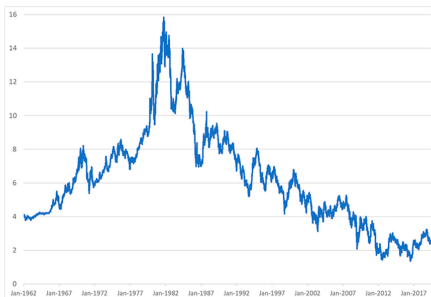
Figure 1. The daily Treasury bond 10-year maturity yield-to-maturity (DSG10).

Figure 1 contains the time-series of our input data on the 10-year Treasury constant maturity rate. It starts out at about 4 percent, then increases to almost 16 percent in the early 1980s, and has been trending down to around 2 percent.