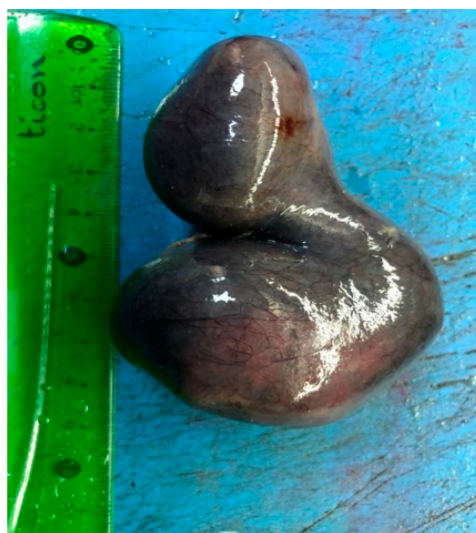
Figure 2. Isolated fallopian tube torsion material caused by hydrohematosalpinx.

Nine of the patients underwent surgery on the day of admission. One patient was operated on four days later after further examinations were performed due to non-relieving pain, previous abdominal pain attacks and the detection of a paraovarian solid mass on USG. Two patients were operated on using the laparoscopic technique, while eight underwent open surgery. Torsioned tubes were equal on both sides. Five patients did not have any additional intervention because of normalized blood supply after detorsion, while the other five patients underwent a cystectomy/salpingectomy (Figure 2). The pathological examination of the resected material revealed changes such as chronic salpingitis along with serosal cysts (Table 2).