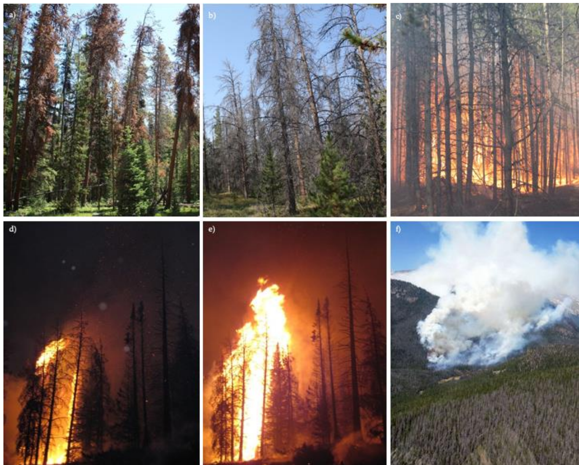
Figure 2. Examples of photos used during interviews with wildland firefighters. (a) red phase of MPB-attacked lodgepole pine forest, Colorado State Forest State Park (photo: Tony Cheng); (b) grey phase of MPB-attacked lodgepole pine forest, Fraser Experimental Forest (photo: Tony Cheng); (c) Wheeler Fire (photo: Southern Rockies Fire Module, The Nature Conservancy); (d,e) Church Park Fire (photo: National Interagency Fire Center InciWeb); (f) Big Meadow Fire, Rocky Mountain National Park (photo: National Park Service).