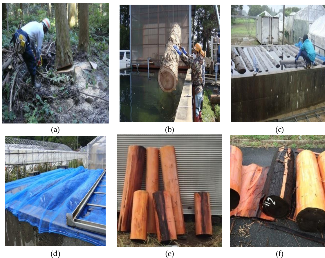
Figure 3. Ponding experiments for Fukushima forest trees. Cutting (a), immersion in the pool of water (b), stems in a pool (c), covered pool (d), vertical drain (e), and horizontal drain (f).