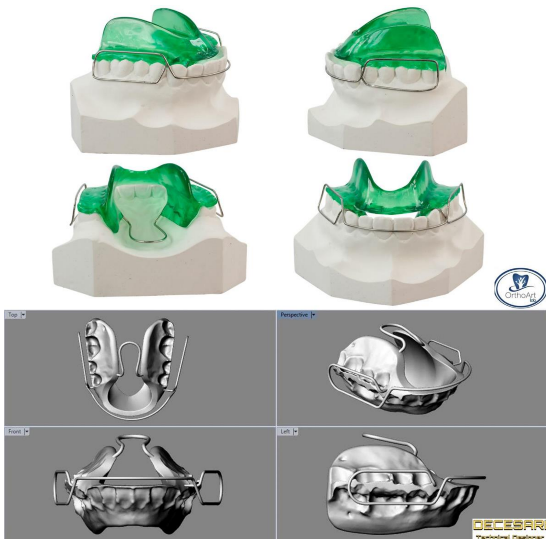
Figure 4. Bionator type 1 appliances realized on plaster and digital models.

year [30]; afterwards, the activator could be used as a retainer for about 12 months, until the end of the mixed dentition phase [38].