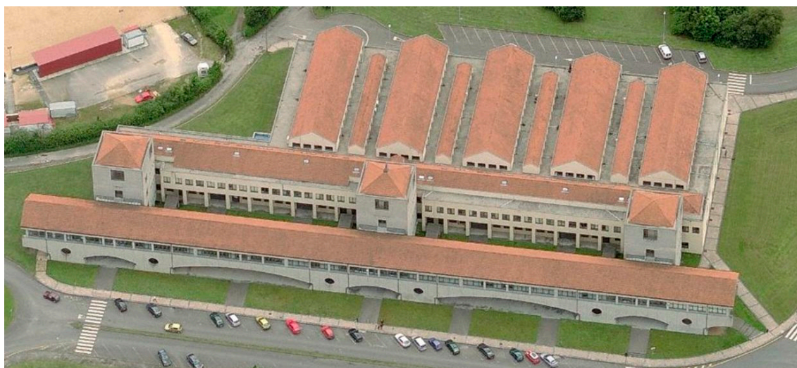
Figure 1. Energy Department Building at the Oviedo University Campus in Gijón.

composed of double glazing and frame with thermal break. This constructive configuration has been set as nominal one to obtain the thermal loads for the base case.