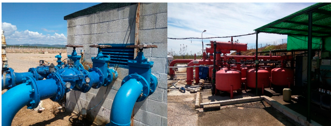
Figure 2. Hydrant and filter plant where the HPP will be installed.

There is a Pressure Reduction Valve (PRV) downstream of the hydrant, which reduces the pressure from 65–75 m to 45 m (see Figure 2). The flow oscillates between 160 and 180 l s -1 during most of the irrigation season for a young walnut plantation. The optimal power calculated is 32.9 kW, with a design conditions of 165 l s -1 of flow and 20 m of pressure. Since the inlet conditions are mostly constant along the irrigation season, with few variations in the flow of \pm 6\% , and the available pressure of more than 20 m, the PAT would always work under its best efficiency point (BEP) conditions along the irrigation season. The estimated energy recovery will be around 56,800 kWh in a full irrigation season. Considering the average Spanish energy tariff in 2017, the payback period is 5.4 years. Nevertheless, due the energy demand of the filter system is much smaller, a 10 kW plant will be installed with an estimated energy saving of 3000 €/year.