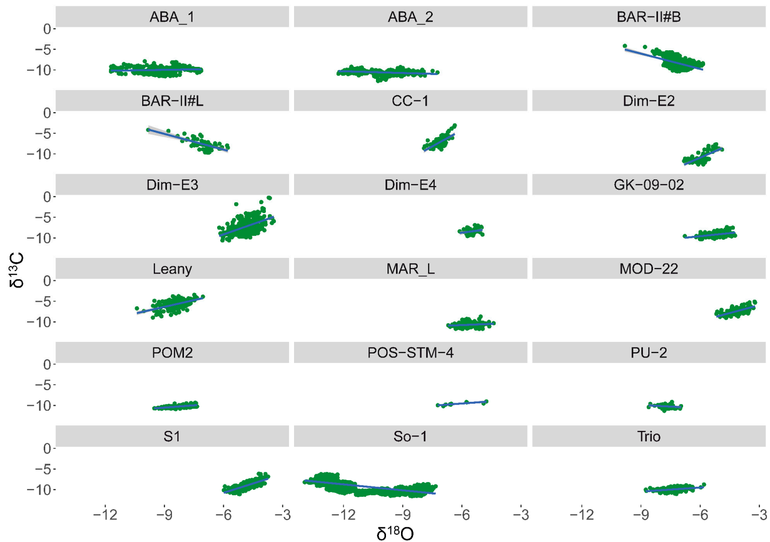
Figure S2. \delta^{13}\text{C} vs. \delta^{18}\text{O} where the blue lines mark the least squares regression lines and the grey envelope curves mark the confidence intervals of the models. The statistics of the plotted regression models can be found in Table S1.