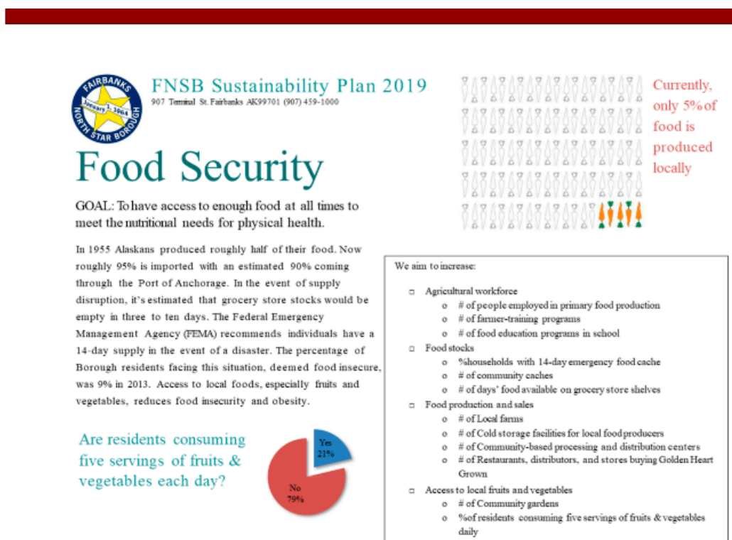
Figure 3. FNSB Dashboard on Food Security.

To do that, the sustainability commission turned to the use of dashboards as a way of communicating with members of the public and soliciting their feedback. Such dashboards have great power in conveying information to citizens about a city’s sustainability performance because they summarize information in an easy-to-read graphic form [30,31], but they should not be used uncritically because they can oversimplify complex situations and be manipulated by vested interests in some cases [32–36]. Figure 3 shows a preliminary dashboard used by the commission.