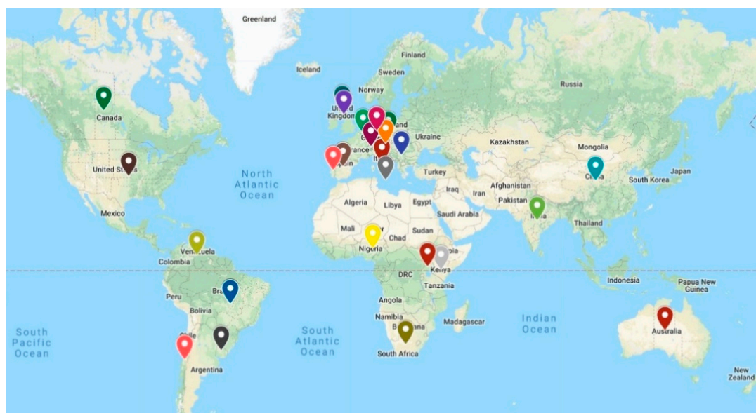
Figure 1. Countries from which questionnaires were returned.

A total of 237 questionnaires were received from 51 countries around the world. Most respondents are from the United Kingdom ( n = 52 ), the United States ( n = 33 ), Brazil ( n = 23 ), Portugal ( n = 12 ) and Australia ( n = 10 ). All responses were divided into six separate groups according to the region where the university is located. The most represented region was Europe with 43% of the replies, followed by South America (21%), North America (16%), Africa (10%), Asia (5%) and Oceania with 5% of all the replies. Figure 1 shows the countries participating in the study.