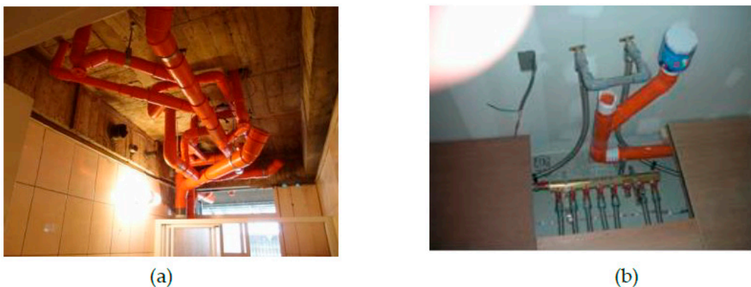
Figure 2. (a) Exposed equipment pipeline; (b) equipment pipeline maintenance available on each floor.