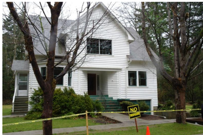
Figure 2. Twilight Saga tourists are confronted with barriers and security staff at the site of the Swan family house film location in British Columbia, Canada. The set location was later demolished by the production company.