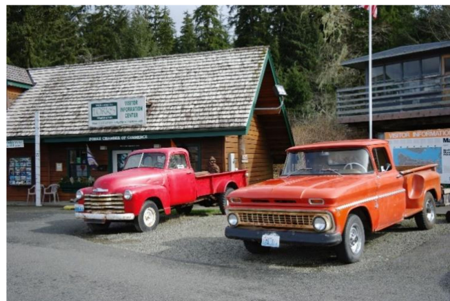
Figure 1. Twilight Saga character Bella Swan’s car parked outside Forks Visitor Center, WA, USA. One of the car models is described in the books and the other used in the films.

One conflict between the popular culture fictional images and “reality”, perhaps unique for the popular culture servicescape, is when visitors’ expectations alter between images induced by the novels and images induced by the films (see Figure 1). In the case of the Twilight Saga, the settings of the novels sometimes differ from the locations featured in the films. This tends to sometimes cause confusion and disappointment among the Twilight Saga tourists. However, in some cases the original setting of the story seems to dominate the Twilight Saga tourists’ mental image. Nevertheless, a change of location for filming might provoke residents of the local community where the story takes place, and as a result, make local marketing efforts weak.