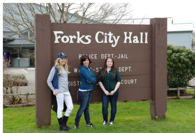
Figure 3. Tourists dress up as the Twilight Saga characters. Rosalie, Alice, and Bella during their visit in Forks, WA, USA.

According to tourism stakeholders in Montepulciano, Italy, their solution to Twilight Saga copyright restrictions was that a local merchant registered copyright for “Montepulciano, City of New Moon” and later donated it to the town: