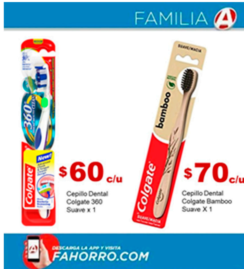
Figure A1. Advertisement of the green product in Mexico.