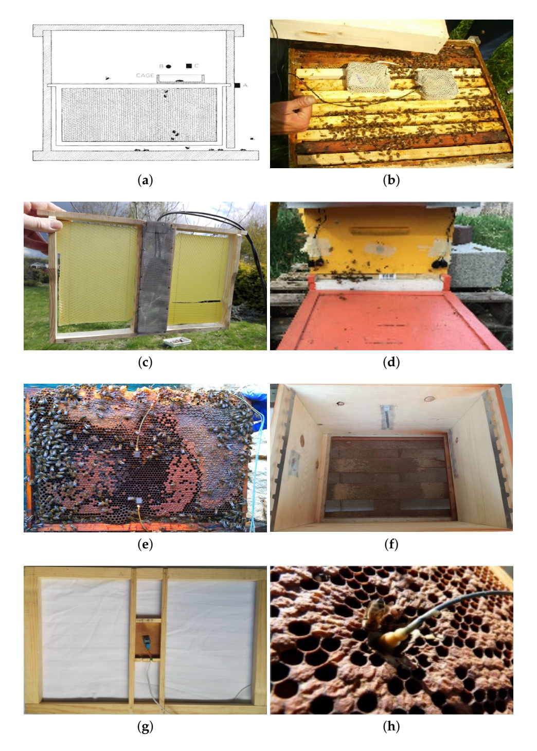
Figure 2. Different microphones and accelerometers placement inside the colonies, based on different approaches. In particular: in (a) from [27], B is the microphone used and it is placed above the queen cage. (b) shows the microphone placement of [63]: the sensors are placed upon the brood frames inside a cage to protect them from propolization. (c) shows the solution adopted in [45], where a custom frame with the sensors inside has been chosen. (d) refers to the approach proposed in [44], with microphones placed outside the hive, so that a cage to protect against propolization is not necessary. In (e), accelerometers placement proposed in [43] is presented: the sensors exploit vibrations and do not suffer from propolization problems. (f) belongs to approaches presented in [51,52,57,58]: the microphones are hidden inside the hive walls, and a grid is used to protect them. (g) from [54] shows a custom brood frame. Finally, (h) from [61] shows accelerometers positioning similar to the one proposed in [43].