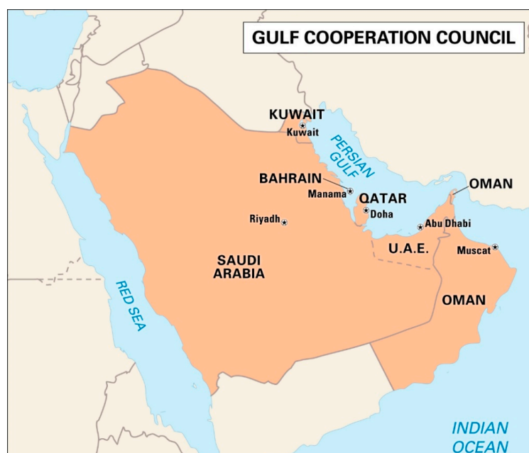
Figure 1. Map of the Gulf Cooperation Council (GCC) countries.

The total area of the GCC countries is 2.6 million km 2 , with an estimated total population of 60 million. Saudi Arabia is the largest country occupying about 85% of the total area of the GCC countries, with a population of 34.8 million (Figure 1). Bahrain occupies 695 km 2 area, with a population of 1.70 million. The population density in Bahrain (800 inhabitants/km) is the highest in all GCC countries. The total area of Oman is 300,000 km 2 , with a population of 5.1 million. Kuwait covers only 17,818 km 2 , with a population of 4.3 million. The population of Qatar is 2.9 million, and it occupies 11,610 km 2 . The United Arab Emirates occupies an area of 77,700 km 2 , with a population of 9.9 million. Over the last two decades, the population of GCC countries has increased substantially due to the influx of foreign workers from developing countries.