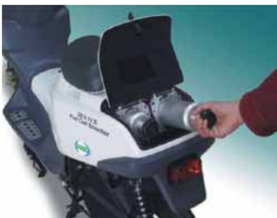
Fig. 7 Metal hydride hydrogen canisters are swappable on the rear of scooter designed by APFCT

APFCT (Asia Pacific Fuel Cell Technologies, http://www.apfct.com ) has a primary business to commercialize polymer electrolyte membrane fuel cells. It is futuring to be provider of fuel cell stacks and systems, to enter commercialization of fuel cell with scooter engines and mobile power generators, to develop safe and convenient metal hydride hydrogen storage and distribution system. A project partly sponsored by government is to develop a parallel hybrid scooter in which a 28V PEMFC system can deliver over 1.5kW peak power and a 36V high power lithium battery pack is served as power buffer whenever starting up or heavy load is required. There is a converter between two power systems to boost voltage of fuel cell up to 36V. Refueling is easily done by swapping the metal hydride hydrogen canisters as shown in figure 7, therefore, it needs not charge infrastructure. The target speed of the vehicle is 60km/h. A fleet of forty scooters will be put into demonstration with the help of China Petroleum Corporation to set up refueling station in specific area in 2007.