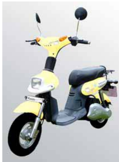
Figure 4: A typical fancy small light electric scooter made by Raido

category vehicle must not exceed 60kg of weight, 30km/h of top speed and 1kW of motor output (detail rule is shown in Table 2).