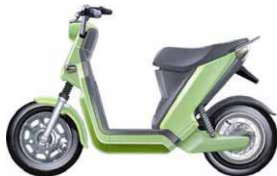
Fig. 8 A dual battery electric scooter designed by WIZ Energy Technology