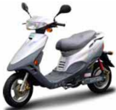
Fig.2 EVT Technology electric scooter