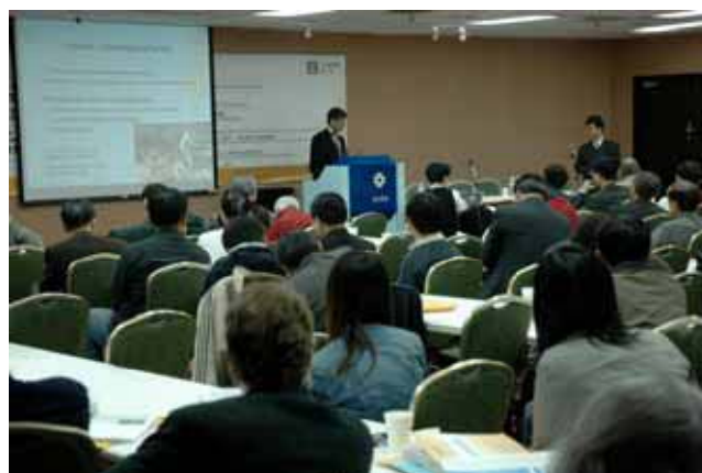
Fig. 5 2006 Taipei International Light Electric Vehicle Conference

There are four activities already become regular every year are relating to electric scooter business which are (1) International Light Electric Vehicle Conference (Figure 5 shows 2006 conference) in parallel with Taipei Cycle Show takes place in March is focusing on worldwide market trend, speaking in English, (2) Light Electric Vehicle Exhibition, a display area is dedicated for LEV in Taipei Cycle Show, (3) Taiwan Electric Vehicle Symposium (TEVS) is focusing on technology trend takes place in August, speaking in Chinese, (4) Electric Vehicle Carnival is an wide open area exhibition with ride and drive and performing stage takes place in September or October.