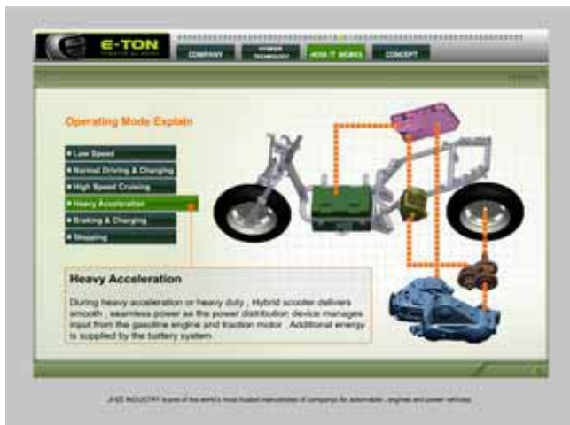
Fig. 6 One of E-TON hybrid scooter operating modes