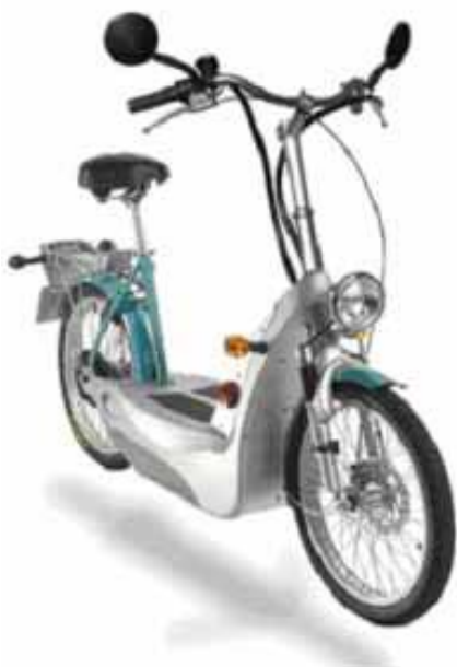
Fig. 3 eGO electric scooter