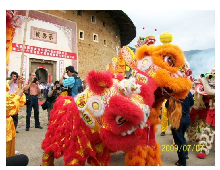
Figure 5. The 2009 anniversary celebration of inscription of Hakka Tulous into World Heritage sites.

Figure 4. The ancestral hall of Zhenchenglou.