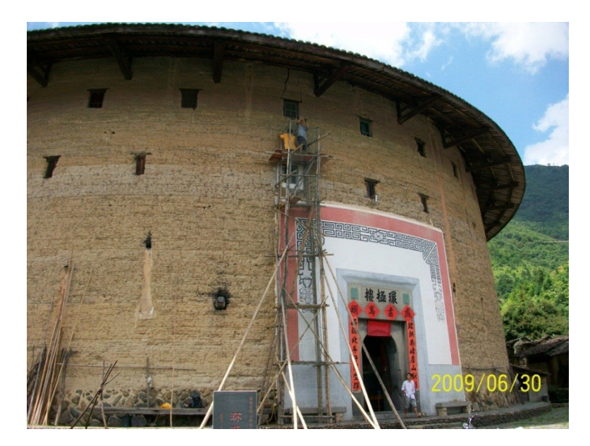
Figure 9. The researchers are investigating the crack of Huanji Tulou.

The earthen walls also work as thermal regulators. When temperatures rise in summer, heat is drawn into the walls helping to cool the air... then as temperatures drop in the winter, heat is released for natural warming.