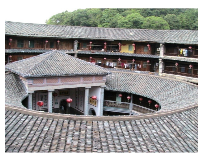
Figure 4. The ancestral hall of Zhenchenglou.

A total of 46 Tulou buildings in the Fujian province, including Hongkeng Tulou cluster, Chuxi Tulou cluster, Tianluokeng Tulou cluster, Gaotou Tulou cluster, were named in 2008 by UNESCO as World Heritage Sites, as "exceptional examples of a building tradition and function exemplifying a particular type of communal living and defensive organization in a harmonious relationship with their environment" [4]. An anniversary celebration of inscription of Hakka Tulous was taking place while the film production team was on site in 2009 (Figure 5). The Hakka are a proud people. They look to the future. A thriving tourism industry and the promise of further economic growth through ecotourism mean the destiny of the Tulous lies in the hands of the Hakka people.