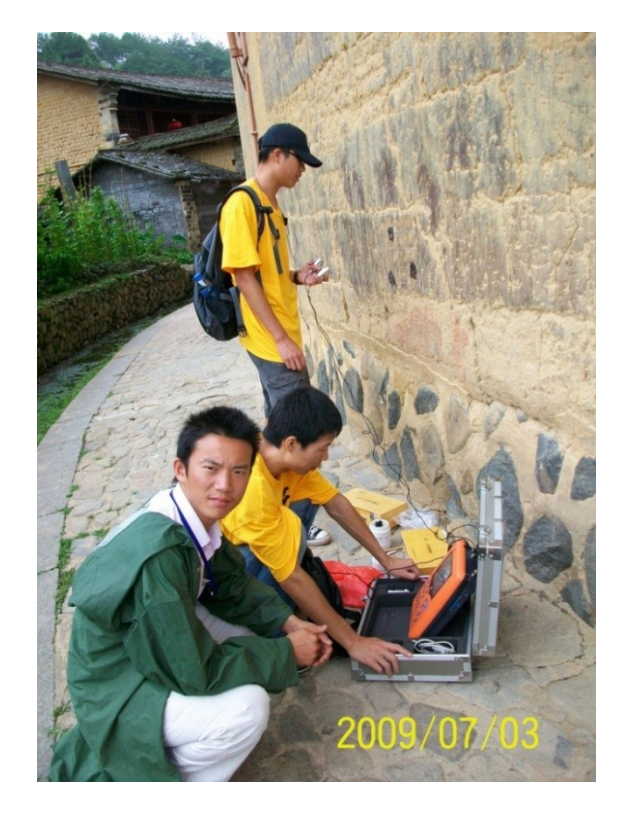
Figure 8. Ultrasonic devices being used to measure the strength of a rammed earth wall.

Another vital component of sustainability is the Tulou's ability to withstand earthquakes. Hakka Tulous have survived material aging, natural weathering and strong earthquakes for hundreds of years. "The thick rammed earth walls integrated with internal wooden structures could be a critical factor contributing to their superior earthquake resistance", Liang explained. "Finite element analyses are conducted to better understand the structural response of a Hakka earth building under earthquake-induced load". But not even Liang's most cutting edge technology could explain how a rammed earth wall might even be able to repair itself after a great quake. It is reported that there was a strong earthquake in 1918. That earthquake created a huge crack in the earth wall of Huanji Tulou, located in Nanxi Village, Hukeng Town. The crack was about three meters long, 20 centimeters wide. But reportedly, that crack just amazingly self-healed, to the present five centimeters wide. Figure 9 shows the researchers from West Virginia University and Xiamen University are investigating the crack of Huanji Tulou. The rammed earth wall of Huanji Tulou was found unreinforced. "If the earth wall were reinforced with bamboo or fir branches, the cracking would not be induced", said Dr. Liang [8].