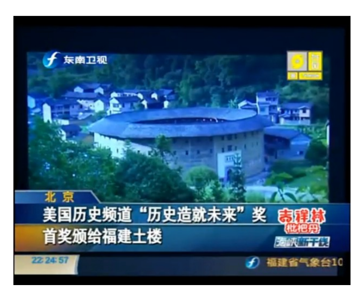
Figure 12. The First History Made for Tomorrow Grant awarded to Fujian Tulou of China by A&E Television Networks (AETN).

So we see a lifestyle and a building that have been maintained and sustained through history into present days, ensuring a history that is made for tomorrow.