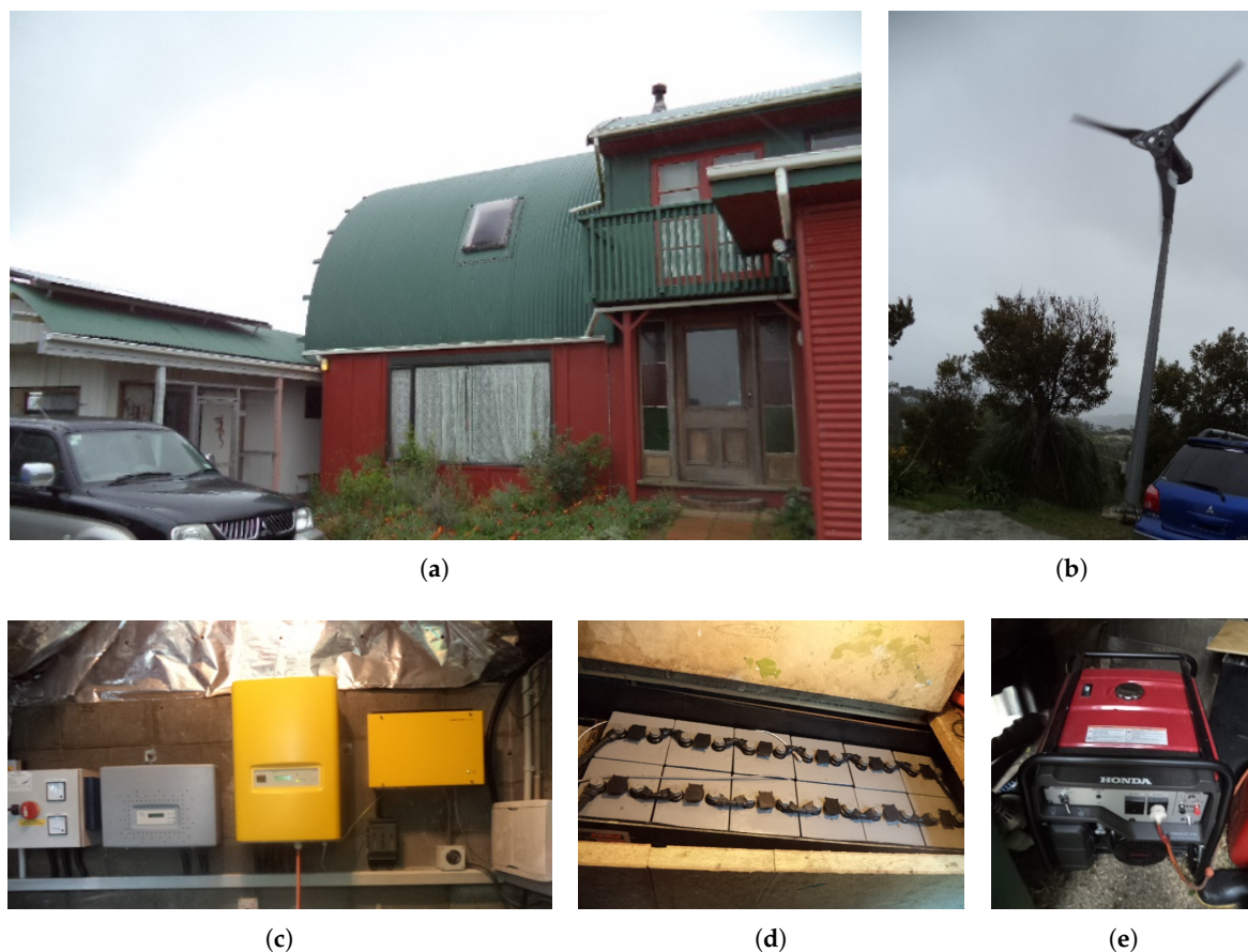
Figure 2. An example of a wind-based microgrid deployed for an off-grid house in Brooklyn, Wellington, New Zealand. (a) PV system on the roof of a house; (b) Wind turbine; (c) Rectifier, controllers and distribution board; (d) Battery bank; (e) Generator.

An example of a wind-based microgrid is shown in Figure 2. The system was installed at an off-grid house in Brooklyn, Wellington, New Zealand [94]. Because wind energy resource is highly intermittent, the microgrid system is designed as a hybrid configuration of wind, solar and petrol resources. The microgrid system is made up of 2.5 kW wind turbine, 1 kW solar PV, 5.5 kVA generator and 1350 Ah, 24 V battery bank for an average daily demand of 10 kWh. Though this off-grid system is not installed in Nigeria, it is used in this study for illustration and a suggestion of its possibility in the country in the future.