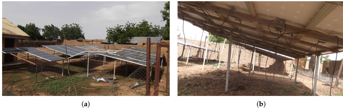
Figure 3. An example of failed 10 kW solar microgrid [131]: (a) The front view of the solar PV modules; (b) The back view of the solar PV modules.

An example of failed 10 kW solar microgrid in Nigeria is shown in Figure 3. The system was installed in 2008 for a village located in Zamfara State, Nigeria [131]. It was designed to power street lights, two houses, a mosque and a clinic before it failed in 2010, just two years after it was commissioned.