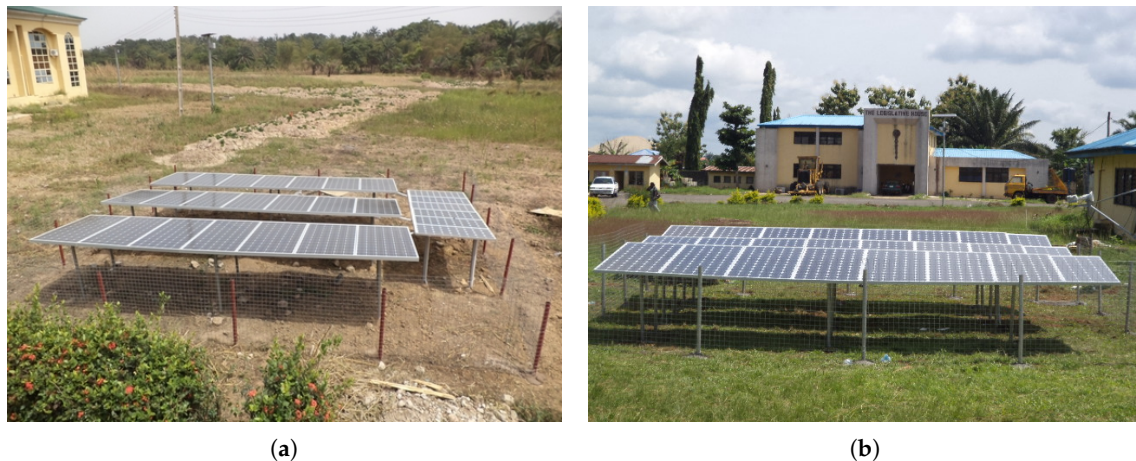
Figure 1. Examples of solar photovoltaic (PV) microgrids with battery banks and inverter controllers. (a) 4.4 kW solar microgrid for Aninri Local Government; (b) 4.2 kW solar microgrid for Atakumosa Local Government.