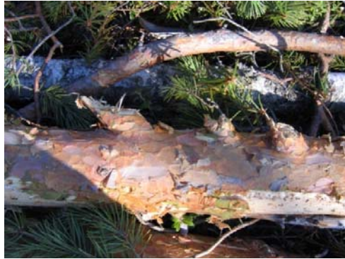
Figure 4. Unprocessed branches.