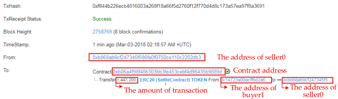
Figure 10. The record of the amount transferred in Metamask.

Assuming that the actual output of the seller is 150 kW, which is insufficient, the seller faces a punishment that the contract is settled at 90% of the transaction price. The amount that the buyer requires paying to the seller is presented in Figure 10. It records the transfer of tokens between the two addresses in the form of an event.