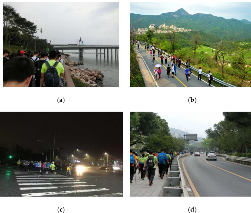
Figure 2. The typical walking environment of the 2016 “Shenzhen 100 km Walking” event [65]: (a): Ocean Bay; (b): mountain area; (c): urban area (walking in the night); (d): rural area.

First, the “Shenzhen 100 km Walking” is a non-competitive long-distance walking event in which participants walk about 100 km within one day, with the hiking routes set up by organizers within the multiple environments of Shenzhen city. The typical walking environments are shown in Figure 2. Not everyone is required to complete the whole 100 km; the organizers believe that participants should choose the distance to walk based on their own abilities. Most of the participants are hiking enthusiasts and some just want to feel the atmosphere of the event. Organizers have stressed that participants enjoy the event as it eases the pressures of life and promotes a healthy and environmentally friendly way of life.