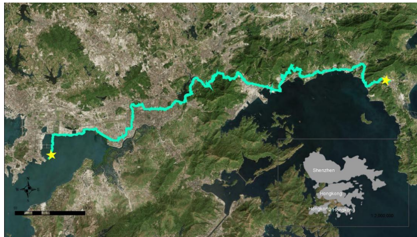
Figure 1. The walking trajectory of the 2016 “Shenzhen 100 km Walking” event.

was 60,723; the actual number of participators was more than 100,000. The walking trajectory of the 2016 event is shown in Figure 1. The walking trajectory is along the southern border of Shenzhen.