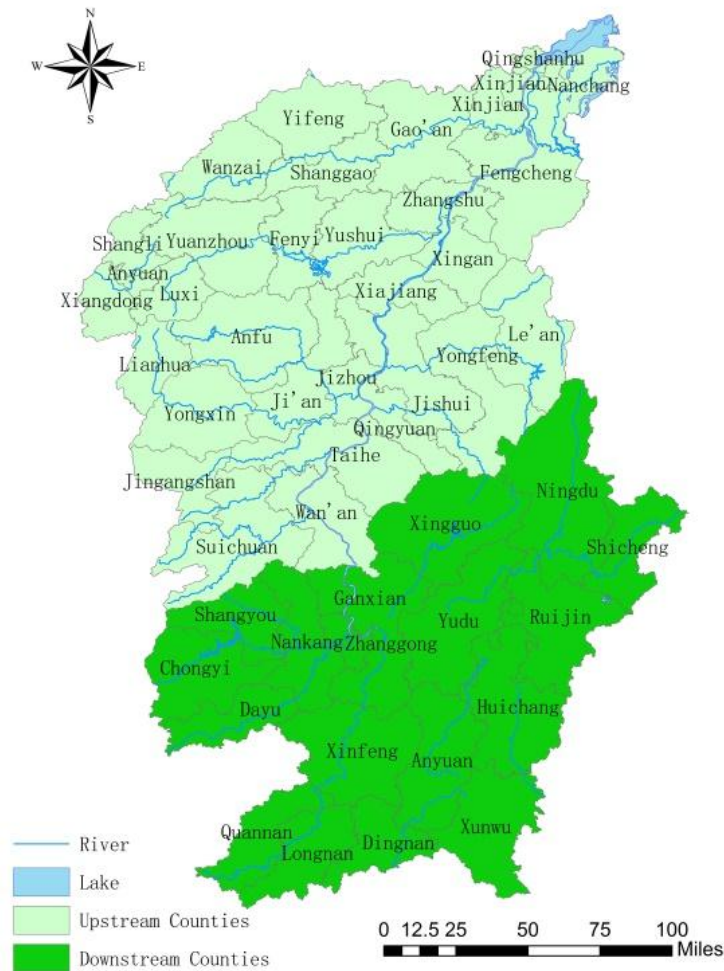
Figure 1. The schematic diagram of the Ganjiang River Basin.

the payment methods. This is valuable information for the government to formulate corresponding policies in the future. Table A1 in the appendix briefly shows the major questions and answers of the questionnaire.