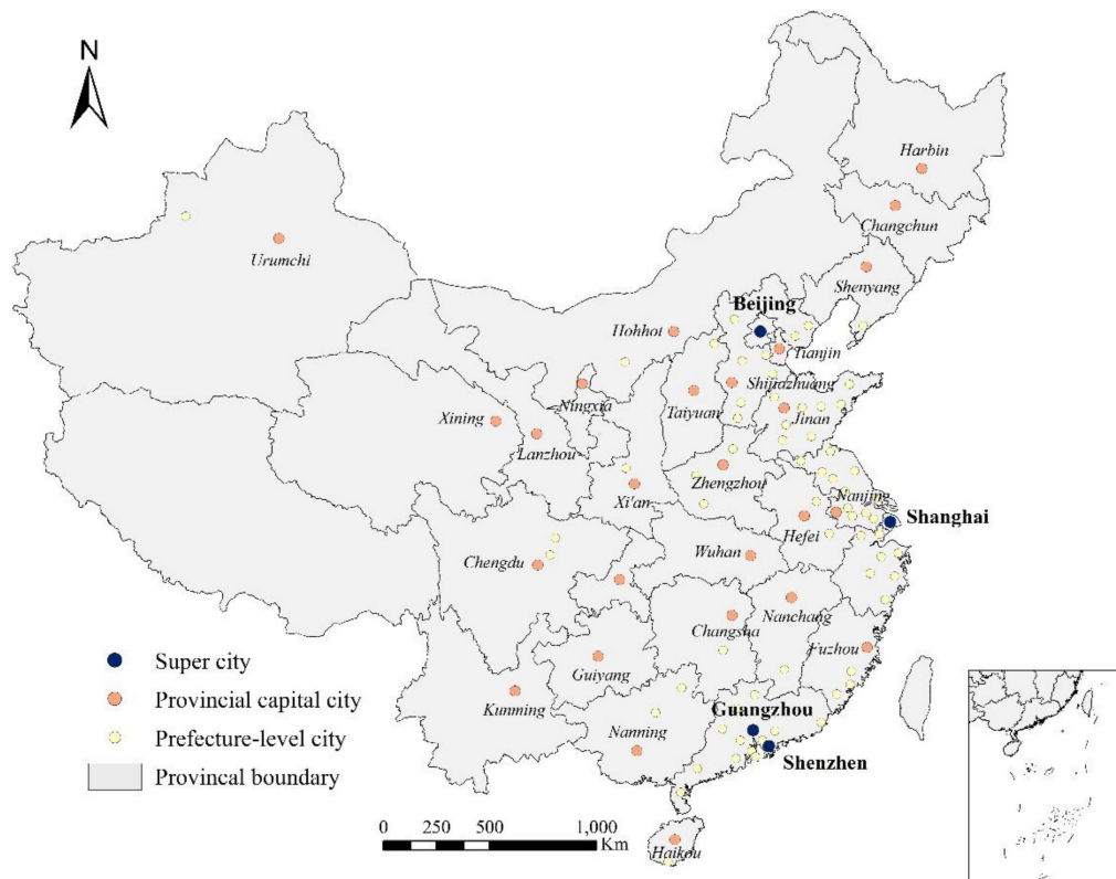
Figure 1. Study cities and their locations.

The 100 cities selected as the study area are from 'The Report on the Traffic Analysis of Major Cities in China for the Second Quarter of 2017'. This report was published by author institutions, such as Gaode Map and the Institute of National Transport Ministry. The Gaode Map is a leading provider of navigation and location-service solutions in China. Their report is based on the massive traffic data of 700 million users. They identified the top 100 traffic-congested cities through big data mining algorithms, and the top 100 cities were selected as the study area of this research (Figure 1).