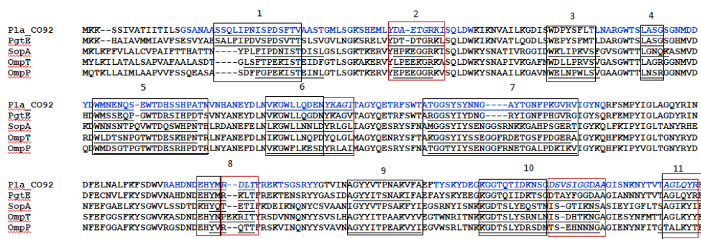
Figure 1. Identification of four major reactive epitopes (indicated in blue) within the pro-omptin molecule and their homology with other omptin family proteases. Alignment of the omptins of different organisms: Pla— Yersinia pestis , PgtE— Salmonella enterica , SopA— Shigella flexneri , OmpT and OmpP— Escherichia coli . Boxes indicate positions of immunodominant regions mapped via immunoreactive peptides.

Overall, ElliPro predicted 46 linear and 24 conformational epitopes for the omptin family (Table 1). The subsequent comparative analysis of the sequences of the pro-omptin Pla with other omptin family proteases, such as PgtE ( Salmonella enterica ), SopA ( Shigella flexneri ), and OmpT and OmpP ( E. coli ) revealed the location of predicted linear B-cell epitopes in either identical positions or in a very close proximity to all nine Pla epitopes predicted by ElliPro and identified serologically using human anti-Pla antisera [30]. Linear epitopes were numbered sequentially from 1 to 11 through the selected proteins of the omptin family. There were at least six linear epitopes common for all five omptins, namely epitopes 1, 2, 5, 7, 8, and 10: four (linear epitopes 4 and 6) for four omptins (omitted in only OmpT); three (linear epitopes 3 and 11) in omptins OmpP, OmpT, and SopA; and epitope 9 in only OmpP and PgtE (Figure 1). The omptin conformational epitopes were formed by the residues of all the relevant predicted linear epitopes for each of the omptins. Additionally, conformational epitopes may include some peptides located at the positions corresponding to one of the 11 omptin linear epitopes that were not predicted for the individual omptin protein. For instance, epitopes 3 and 9 were absent in Pla and were predictable for other omptins, such as OmpP, OmpT, and SopA (epitope 3) and OmpP and PgtE (epitope 9).